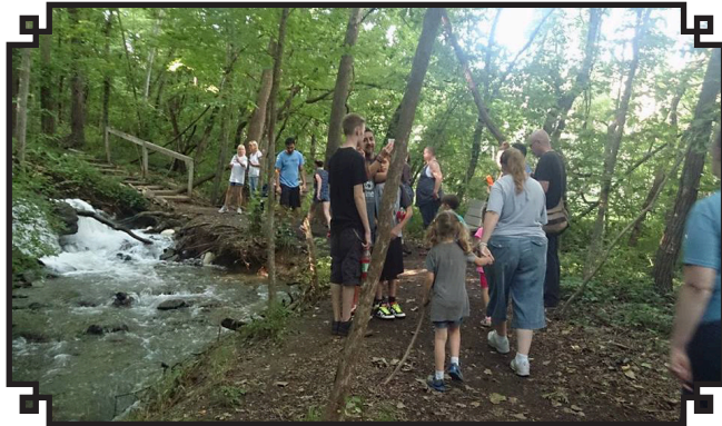
Rime Sangha Social Hiking at Parkville Nature Sanctuary